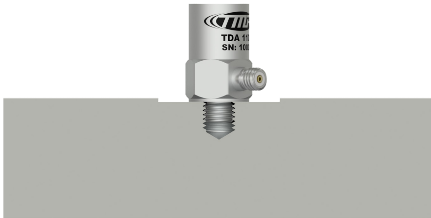
Figure 1. Stud Mounted Sensor