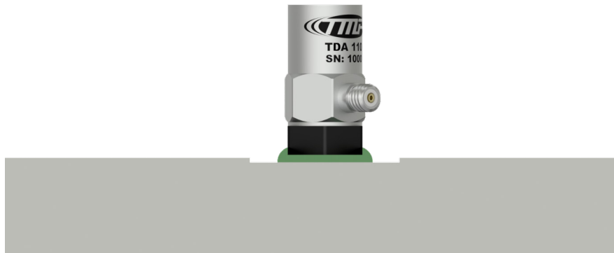
Figure 2. Adhesive Mounted Sensor