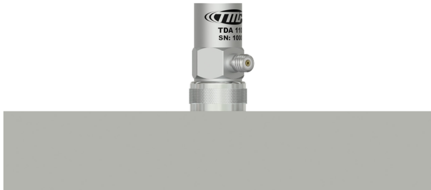
Figure 3. Magnetic Mounted Sensor