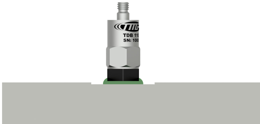
Figure 2. Adhesive Mounted Sensor