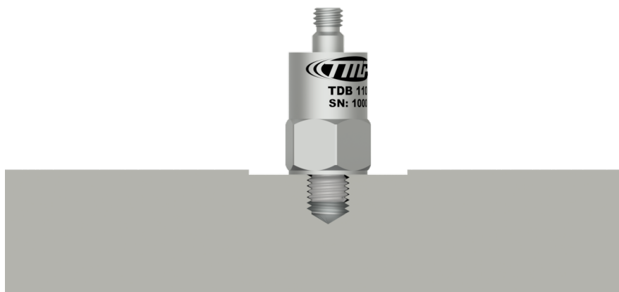
Figure 1. Stud Mounted Sensor