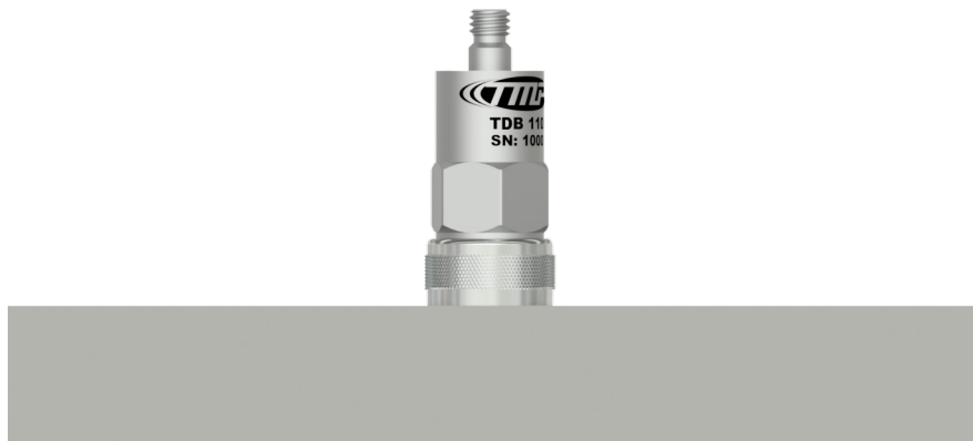
Figure 3. Magnetic Mounted Sensor