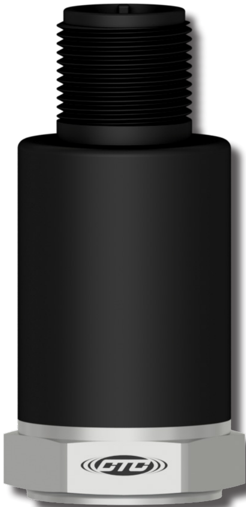
CASE MATERIAL: POLYCARBONATE

MA Series Sensors feature specifications identical to their corresponding AC Series counterparts, at a lower price: