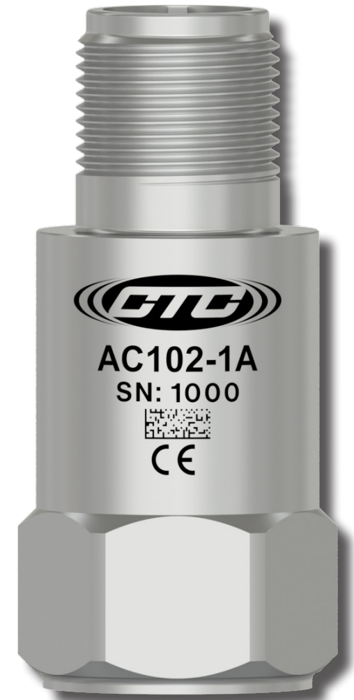
CASE MATERIAL: 316L STAINLESS STEEL