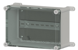
IS200-20A Twenty Channel Barrier Enclosure