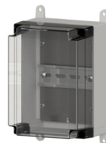
IS200-2A Two Channel Barrier Enclosure