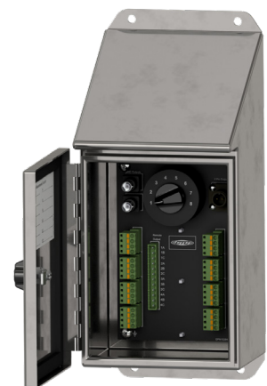
SB282 Dual Input & Output Sloped Top Switch Box