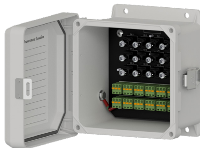
MX102 Enclosed BNC Connection Box