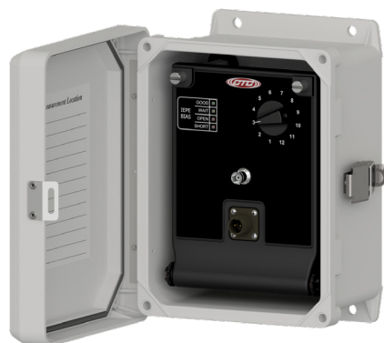
JB110 Standard Capacity, Premium Switch Box with Bias Light Indicator

Cabling from a sensor or barrier can be run back to a CTC junction box located outside the hazardous area. A junction box will protect your cable terminations and provide an easy access point for safe, efficient data collection.