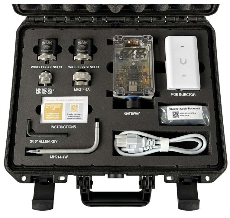
CTC's WSK Series Starter Pack is customized with your choice of two ConnectSens™ Wireless Sensors

Whether you're validating signal strength, comparing data quality, or simply learning how the system integrates into your workflow, we encourage you to push our sensors to their limits. When you're ready to expand, our team will be ready to support your transition to full-scale deployment with no surprises and no pressure.