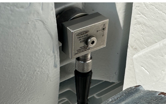
CTC offers both ConnectSens™ wireless sensors (top) and wired accelerometers (bottom) so you can choose what works best for your specific application