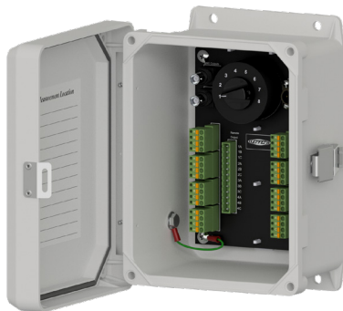
SB142 1-8 Channel Switch Box, Dual Output