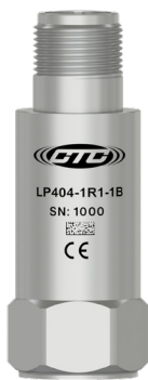
LP404-XXX-1B Dual Output Sensor