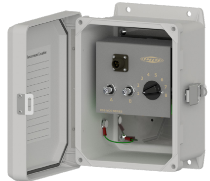
DSB1000 4-8 Channel Modular Switch Box, Dual Output