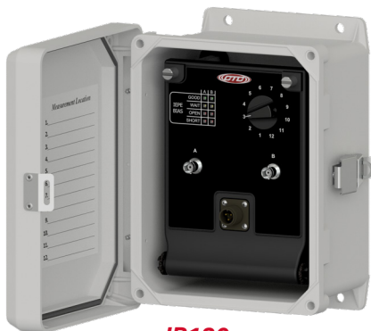
JB120 iBOX, Dual Channel Sensor Input

The JB Series enclosures also feature an IEPE bias indicator light built into the box itself, which can be used to indicate errors in the field wiring or the sensor.