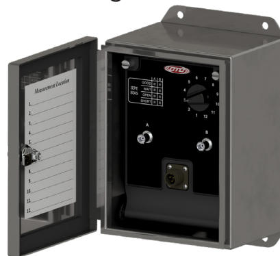
JB220 iBOX, Dual Channel Sensor Input