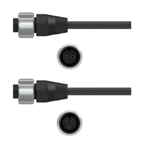
Nylon Molded Connector, 250 °F (121°C)