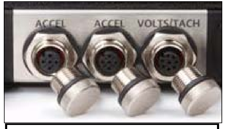
Input ports for CSI 2140 data collector showing 2 separate 5 pin acceleration inputs and one 8 pin voltage/tachometer input port.

The optional "batwing" adapter panel provides 4 individual BNC jacks for acceleration input or voltage input. The most popular method, however, may prove to be any of multiple methods of bringing two channels of acceleration into the standard M12 ports on the top of the 2140. Each of the 2 acceleration ports on the 2140 is capable of taking a minimum of 2 channels of vibration data into the 2140. The pin configuration of the two ports is very different with the lefthand port above (ACCEL port "A") used for Channel A and B inputs and the center port (ACCEL port "B") used for channels C and